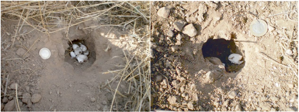
Fig. 2. Nests from Lake Eğirdir (left) and Lake Gölhisar (right)

7 (SD = 1.67). In 2013, 60 females captured from Lake Gölhisar (n = 20), Lake Eğirdir (n = 13), Lake Suğla (n = 17), Akgöl (n = 5) and Asi River Delta (n = 5) were radiographed. Eggs were observed only in 23 of these females (Lake Gölhisar = 10, Lake Eğirdir = 7, Lake Suğla = 5, Asi River Delta = 1). Numbers of eggs observed in these females were 5–10 with an average of 7 (SD = 1.71).