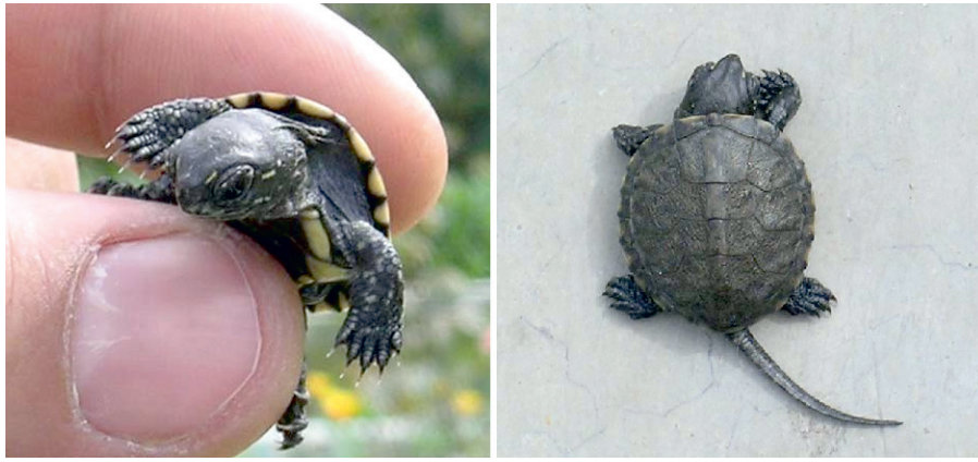
Fig. 4. Captured hatchlings from Lake Eğirdir

ecological data on Asian populations are only anecdotal and inadequate for constructing effective conservation and management plans.