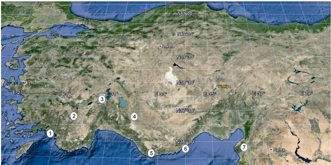
Fig. 1. Location of the surveyed localities: Kocagöl (1), Lake Gölhisar (2), Lake Eğirdir (3), Lake Suğla (4), Anamur (5), Akgöl (6), Asi River Delta (7)

Normality of the SCL and PL distributions for sexes was tested with the Kolmogorov-Smirnov D test. Since they were normally distributed ( p \geq 0.05 ), parametric t-test was used for their comparisons. The non-parametric Spearman's rank correlation was used to estimate the relationship between SCL, PL, and clutch size, as the data were